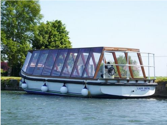
Lady Jayne can carry 15 people

In aid of the Driffield Navigation Amenities Association, supported by the Driffield Navigation Trust