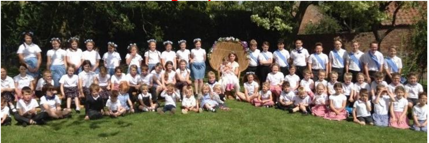
Mayday Photos from the school website