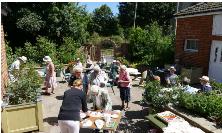
A superb day for The Vicarage Open Garden.