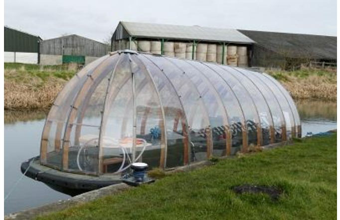
Driffield Navigator can carry up to 10