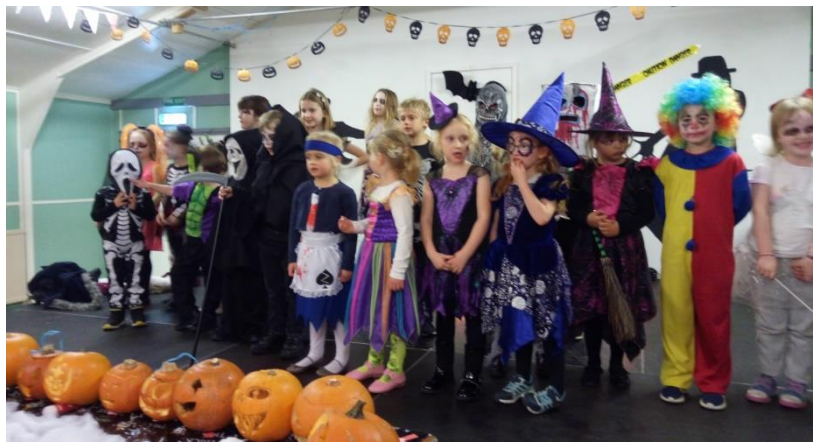
A very successful Halloween party which raised £150 towards village hall improvements.