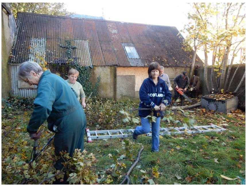
Volunteers get some autumn exercise at Townlands Barn.

have been felled at the front and the side, but more work is needed to be done at the back.