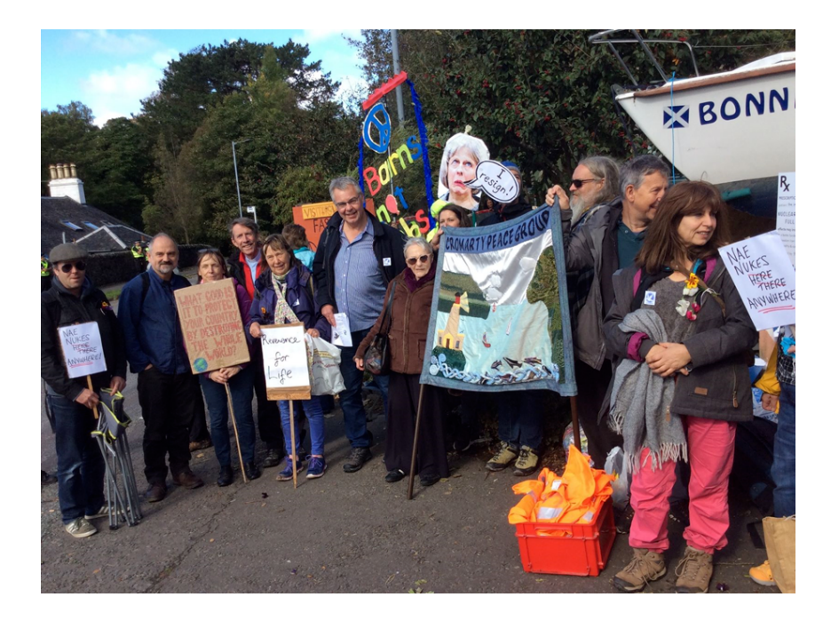
Members of the Peace Group outside Faslane in September.