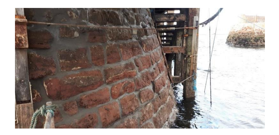
and after grouting (I thought doing my bathroom was difficult - Ed)