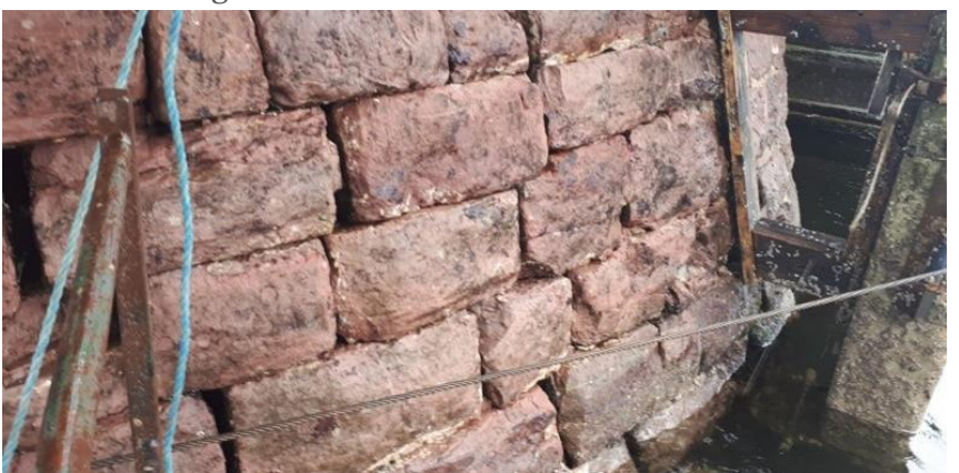
Harbour after cleaning...

In the process of undertaking this work we uncovered what appears to have been a chamber constructed from concrete and stone to house a WW2 mine. Fortunately, there were no longer any munitions in the hole but many thanks to the Police and Coast Guard who responded with alacrity to advise on the situation and our contractors who bravely excavated by hand in strong winds and encroaching darkness.