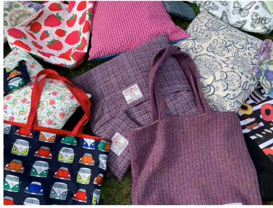
Last year's Sewing Weekend