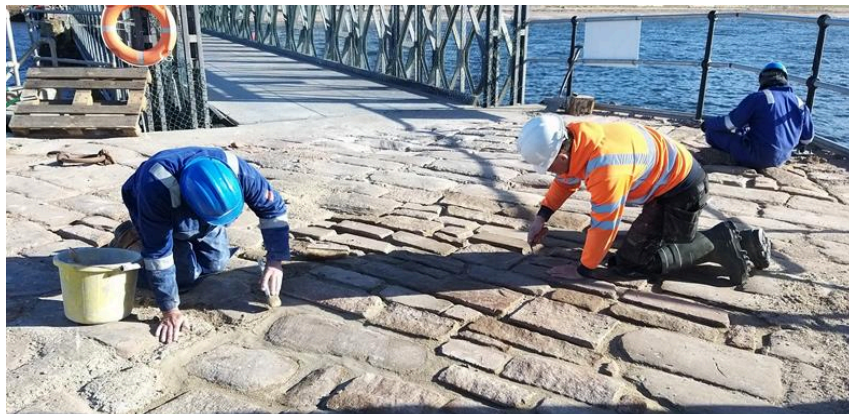
Mole repairs at the harbour

Finally, I should clarify there is no truth in the rumour that we will be renaming Cromarty Harbour "Cromarty Marina"... It must just be the time of the year!