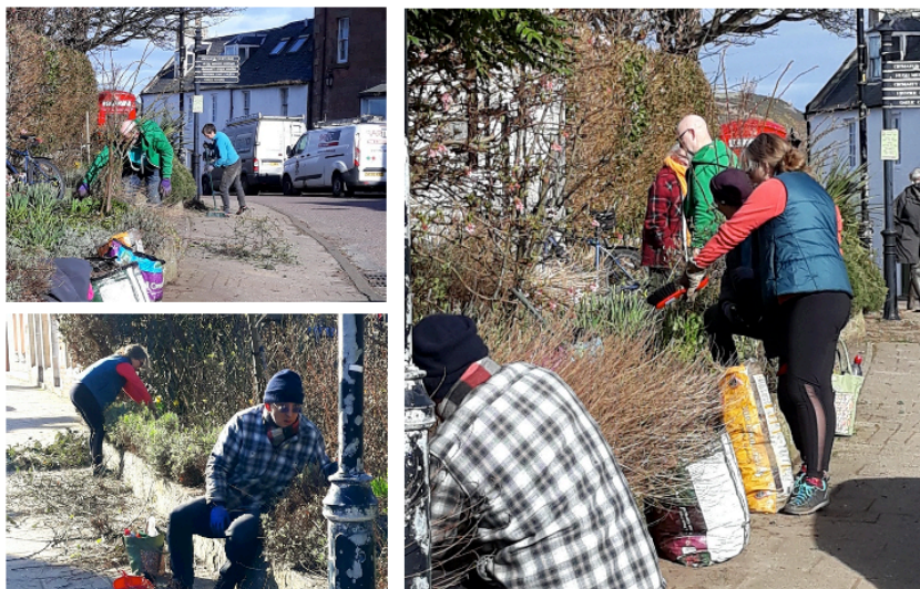
Volunteers giving the community beds a spring clean in the sunshine.