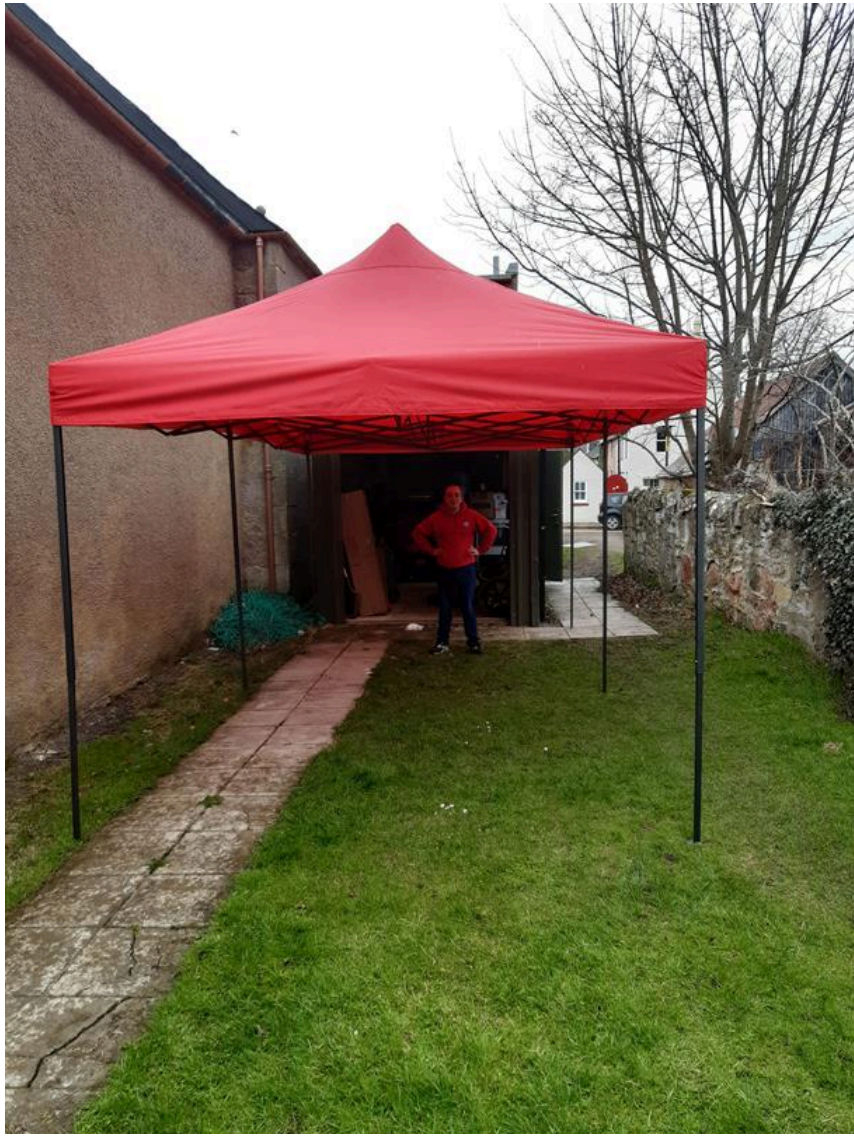
Cromarty Youth Café's outdoor home.