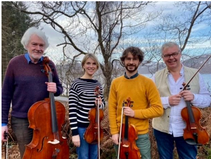
THE AURORA QUARTET, Easter Sunday 17th April at 4pm (doors 3.30pm), Stables.

And don't forget, THE RIOT OF RESOLIS tickets for both performances on Friday 6th May are selling well so get yours now to ensure not to miss out!