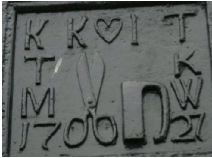
The marriage stone at 7, Braehead: come find out more on Thursday 17th February at the Old Brewery!

Well, that's all we have folks! Here's hoping everyone stayed safe during the storms, and that your 2022 is shaping up to be a great year.