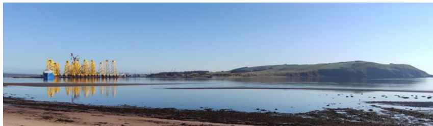
Photo taken 19th April 2022, Shore St., Cromarty

This could be our view by April 2032 or sooner...