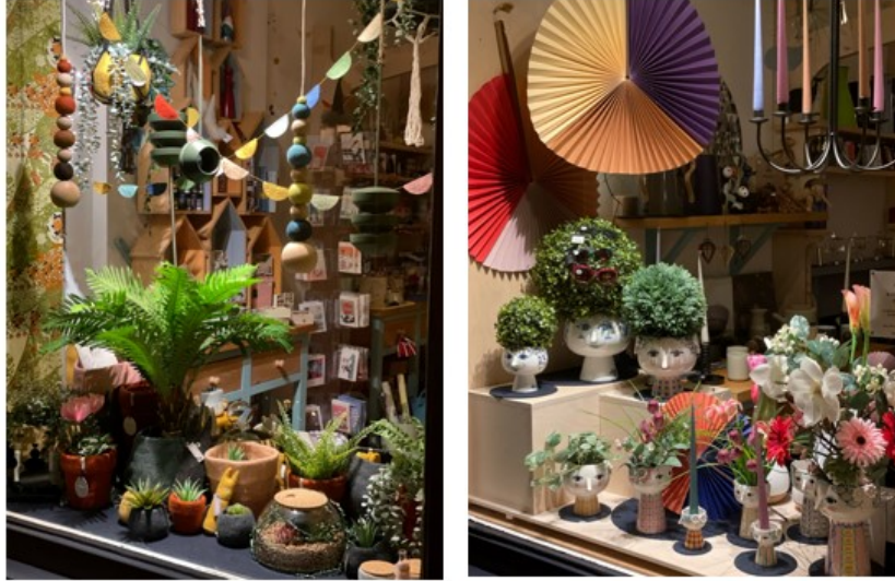
The beautiful new window at Ingrid's House!