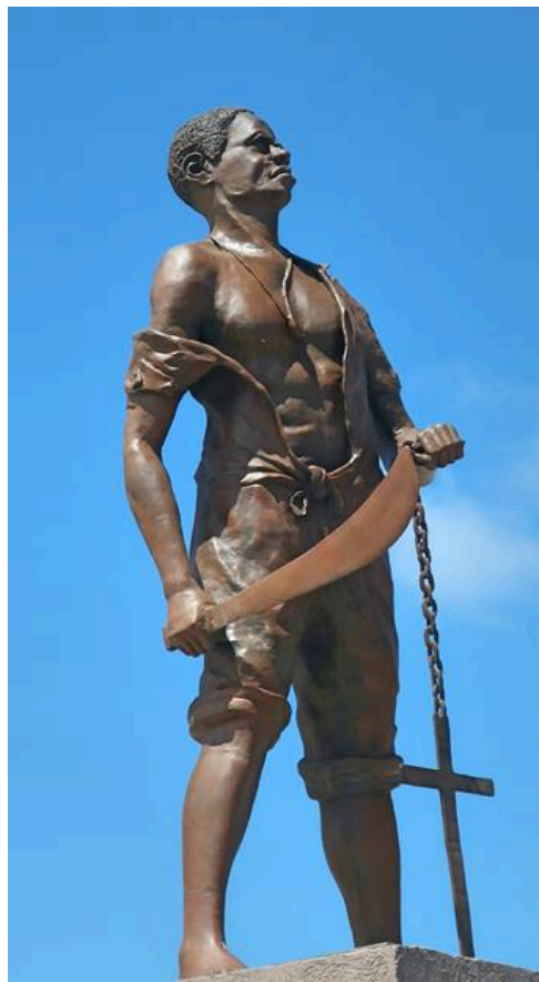
Quamina – Guyana national hero

Thursday 24 March, 7.30pm, The Old Brewery, Cromarty, all are welcome. £3 each meeting