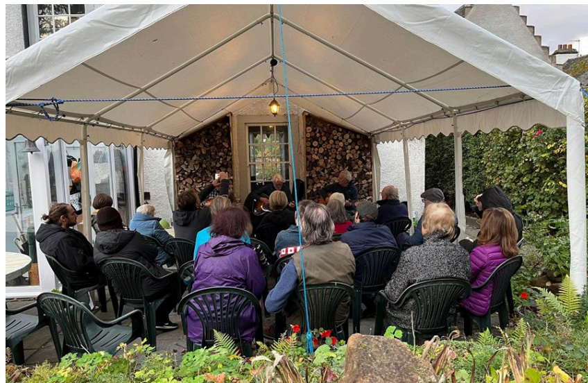
The Disclaimers at Wellington House