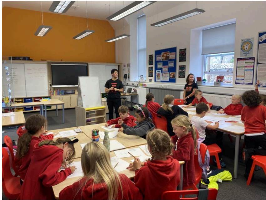
Young workshop participants at The Old Buoy Store

Thank you to everyone who visited us last month, we look forward to seeing you again in November!