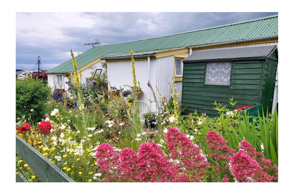
From Alison Palmer:

The week-long Art & Flowers display followed at the weekend by the Open Gardens certainly showed Cromarty at its very best to the many who came to visit.