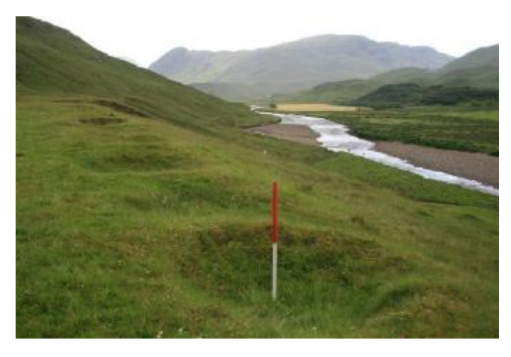
Storage pits at Achadh an Eas, near Scardroy

It occurred to me that an interesting exercise would be to explore the relationship between the population numbers (signified by OPR births between 1815 and 1832) and the number of pits at the different settlements. The known sheep farm lets and occurrence of sheepfolds would also be relevant. First impressions appear to be that there is a correlation between the pits and the population numbers at certain of the settlements; Achness has 19 births and 22 pits and Invermeinie has 35 births and 17 pits, whereas Inverchoran has 1 birth and no pits and Backlinan has 2 births and no pits. But it is not as simple as that. There are lots of anomalies, Blarnabee for instance has 4 births and 12 pits, this could be explained by the fact that there was a sudden expansion of the population there in the 1841 census to 54, but yet Corrievuic which has a population of 64 in the 1841 census has only 8 pits. There are other factors coming into the equation too; some of the pits for example may have been swept away by later agricultural activity or some of the written records may be "suspect". My research continues.