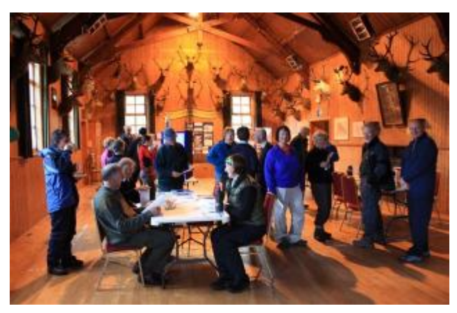
The Strathconon Exhibition in Milton Village Hall

Certainly over the 4 "manned" days we met about 150 people. The Village Hall is quite "a treasure" having been built by Colonel Christian Coombe at the end of the 19<sup>th</sup> Century. Even though the Hall is in a remote location it seemed a fitting setting to display the results of our project and it had the added advantage of being open at all times, so that folk could come and go over the 8 week period.