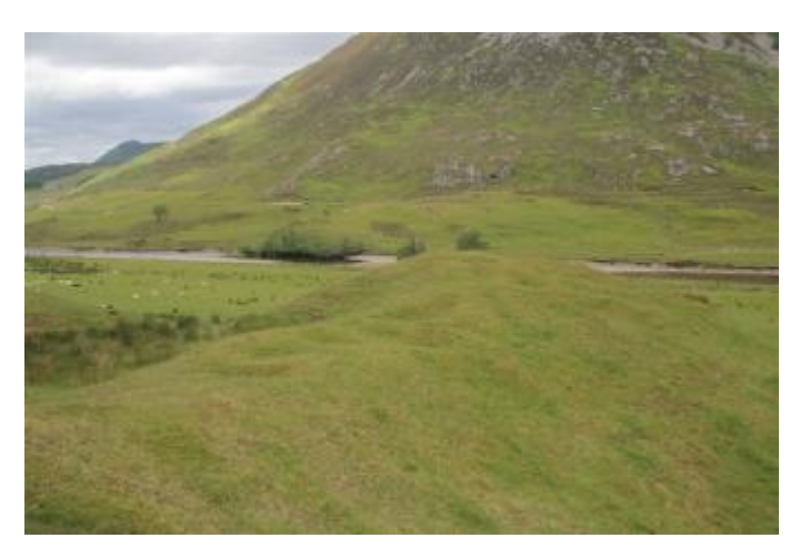
Storage pits at Blar na Beithe

One of the many things that have exercised my thoughts is the distribution of storage pits in the Upper Glen. 78 have been recorded in 6 different locations. They are always situated in airy, well-drained positions and are generally between 1-2 metres in diameter and 0.3-0.8m in depth – some have a raised bank around the perimeter. Although these features are widespread in the Highlands, no research seems to have been done on them. Their purpose is uncertain, but it is generally suspected that they were used for storing potatoes on the other hand they may also have been for storing grain or turnips.