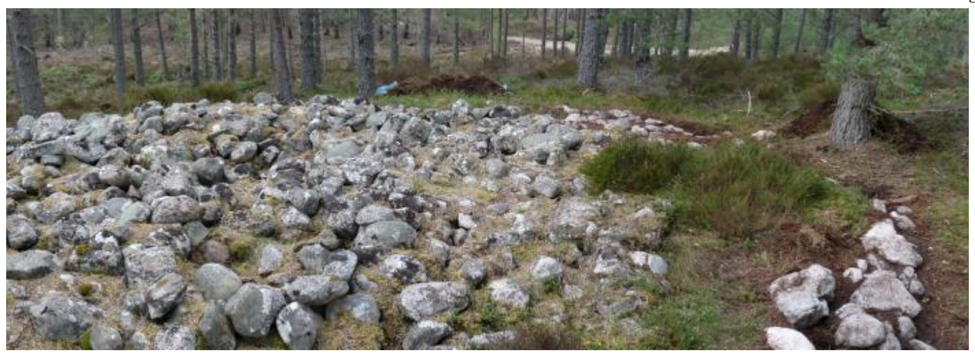
The Boat of Garten Cairn