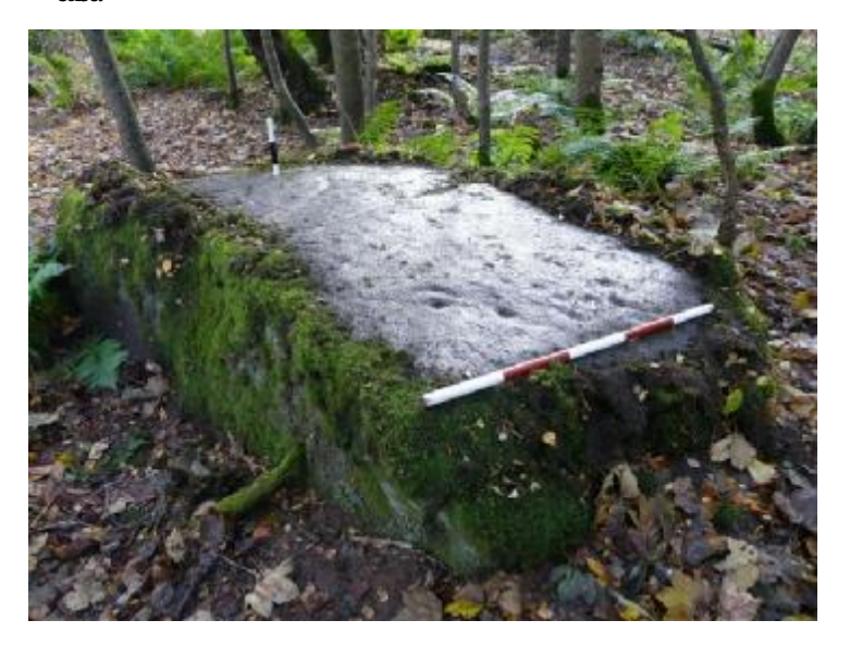
Cup marked stone at Achterneed

About a month ago Trina and I were making a survey of the old woodland at Achterneed, below the railway line, and within 10 minutes Trina had found a large smooth slab of schist with 'about a dozen cup marks on it'. We also discovered a possible standing stone in the same wood further east.