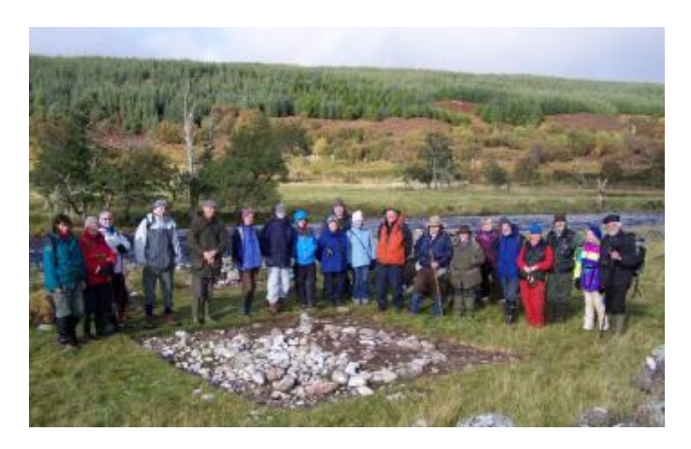
HAF Participants inspect the hay stacking platform at Kilfeddermore.

A circular feature, about 3m in diameter, to the SE of the smiddy building, proved to be a raised stone platform area, on which it is thought was placed a stack of drying hay or corn. Several pieces of a late 18th-early 19th Century green glass wine bottle have been found amongst the stones of this stacking platform, as well as 6 more incomplete pieces of used mill-stone.