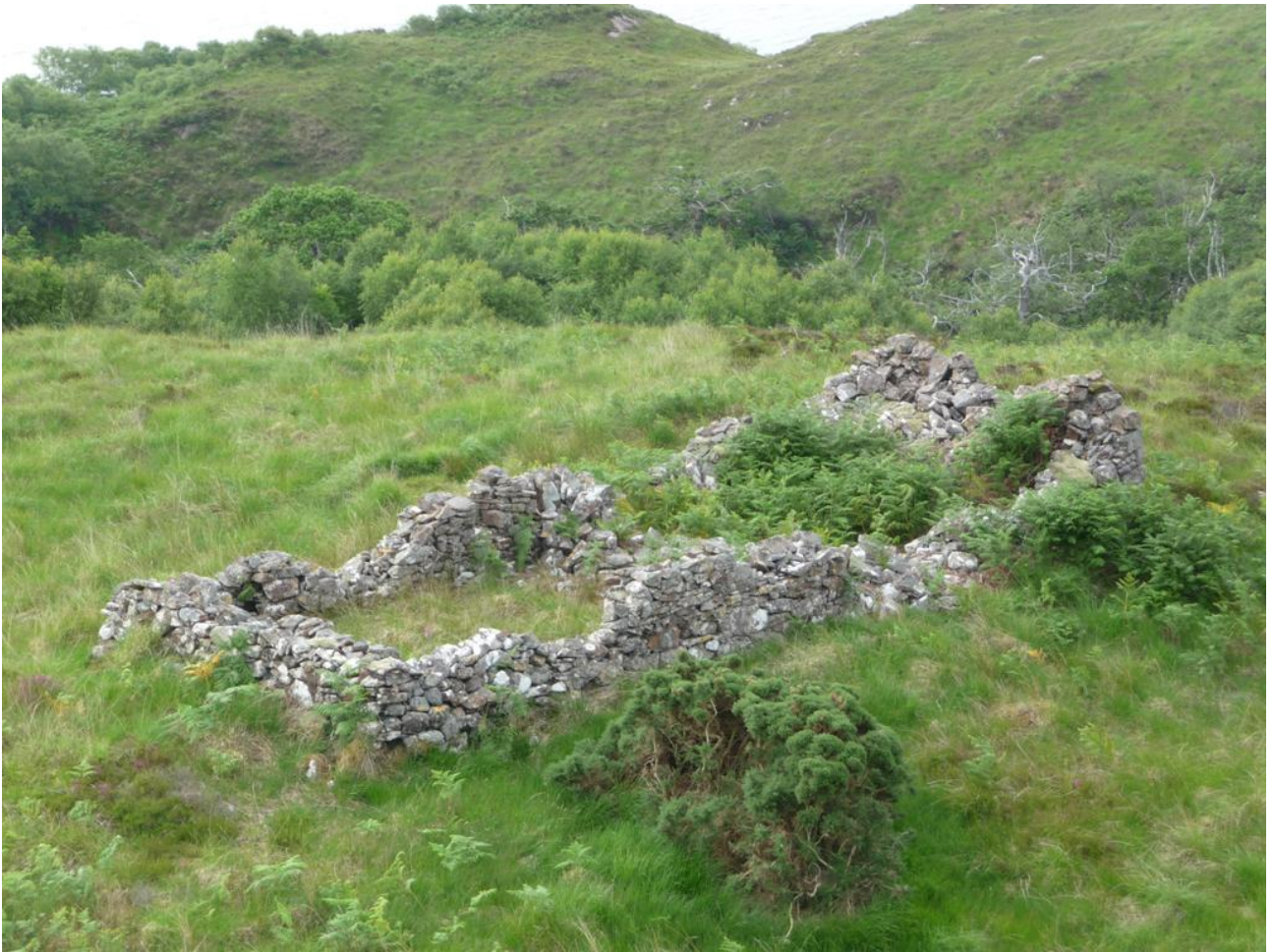
Figure 3: Longhouse site 8