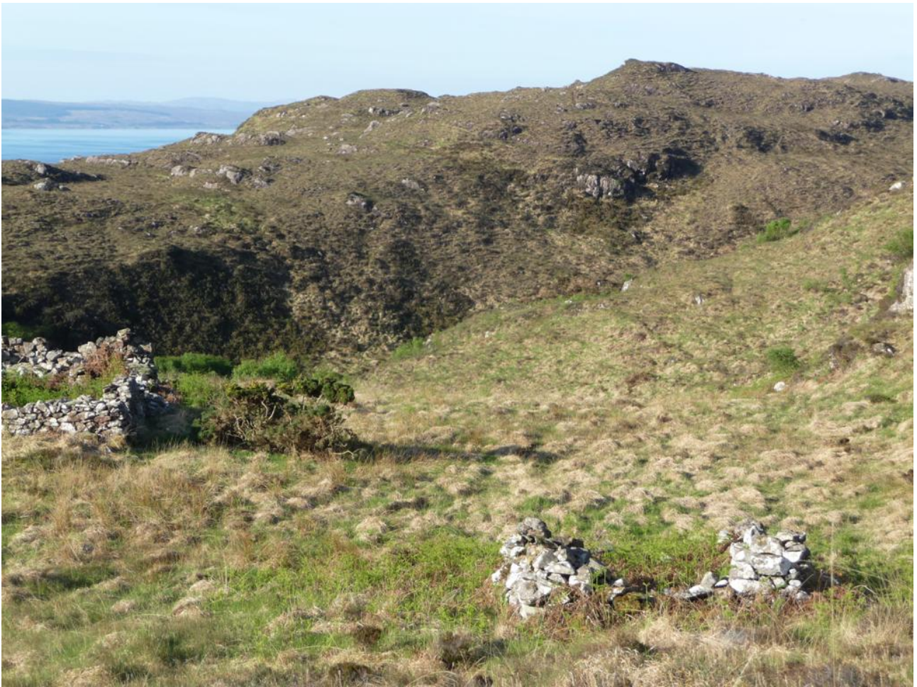
Figure 6: Sites 8 and 9

Site 9 Building ( remains of ) NG76033620 Building not far from and uphill from the longhouse . It measures 5.7m by 2.5m internally and the walls stand up to 1.4m high. See photo.