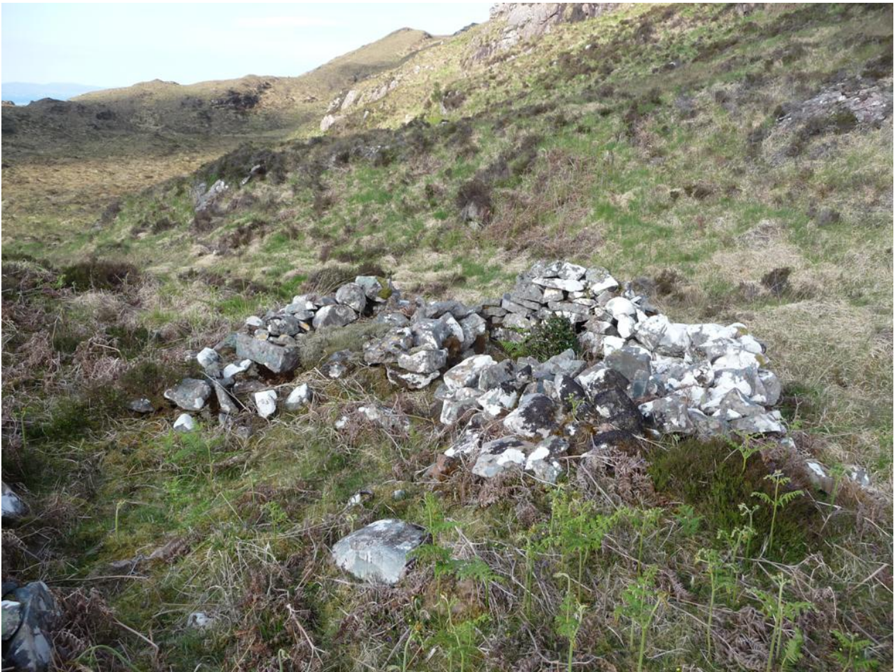
Figure 6: Site 12

Site 13 NG 7585 3617 Sheiling hut 4.8m by 2.1m internally with rounded corners and a rubble wall up to 70cms high. The entrance is on the south. Nearby a short length of dyke foundations and a clearance cairn are probably contemporary.