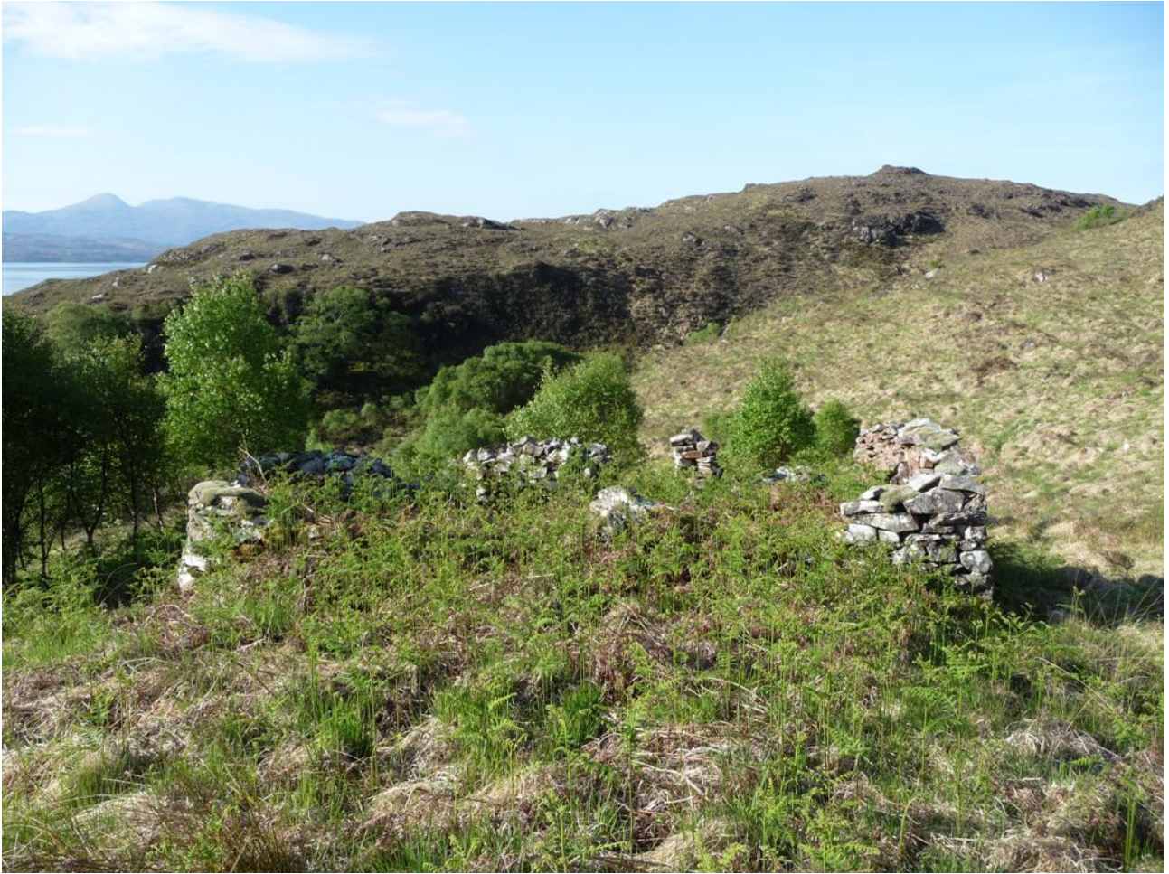
Figure 2: Site 7

Site 7 House (remains of). NG 7594 3611 A quite well preserved building measuring 7.1m by 2.5m internally within walls up to 2.4m high at the gable on the west. The entrance is on the south west. To the west are the slight remains of a dyke enclosing an associated “field “ See photo.