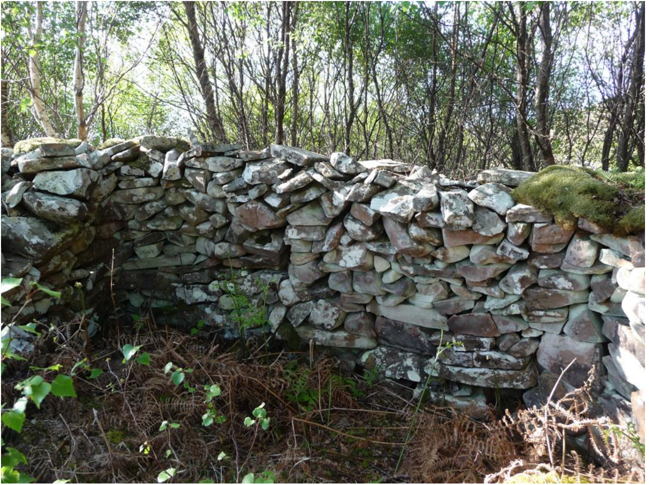
Figure 4: site 10 corbelled gable