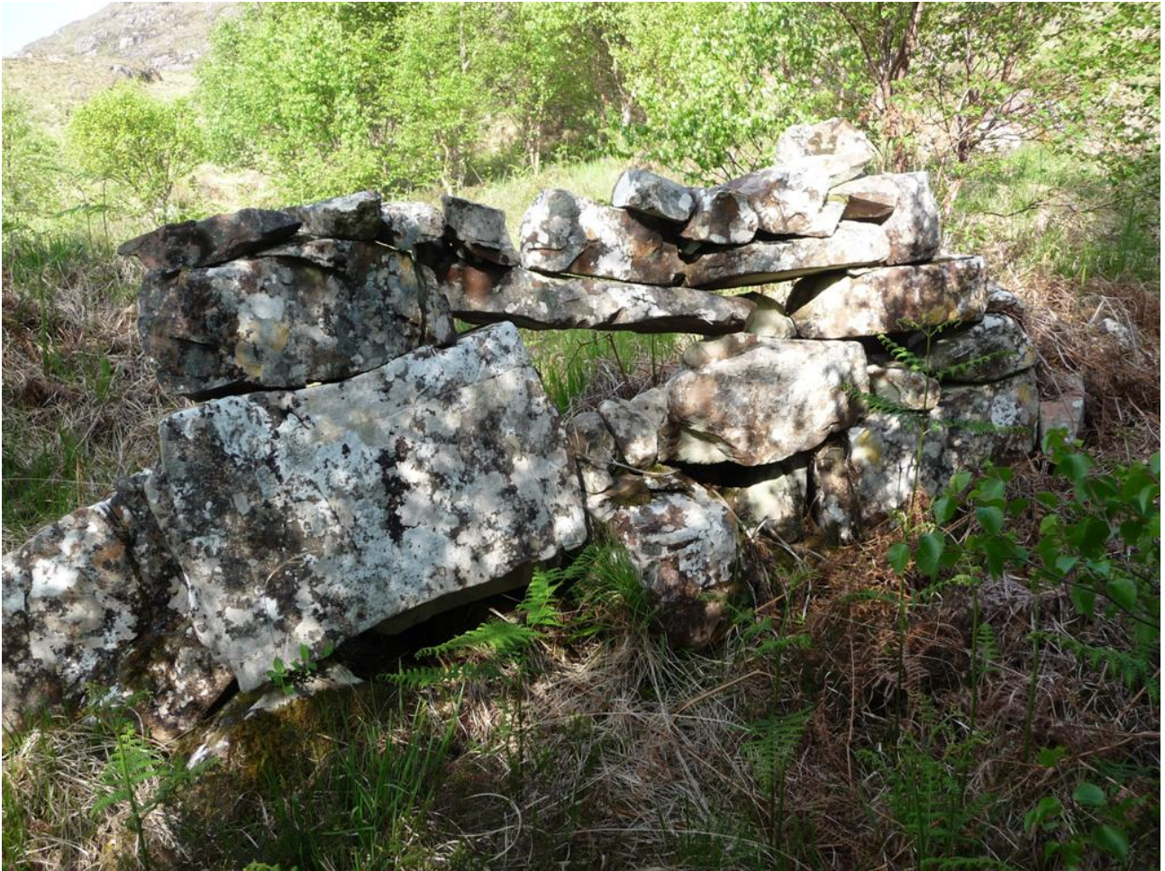
Figure 5: Site 10 enclosure wall

Site 11 Building (remains of )NG75893609 On the sheltered edge of a knoll, a building foundation quite denuded measuring 8.0 m by 2.5 m internally within walls up to 90cms high and 1.2m wide at gable.