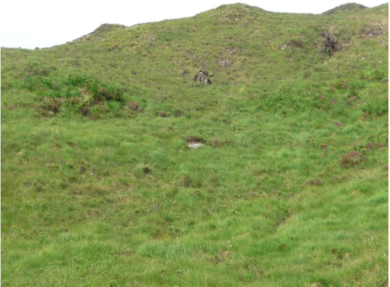
stone in centre