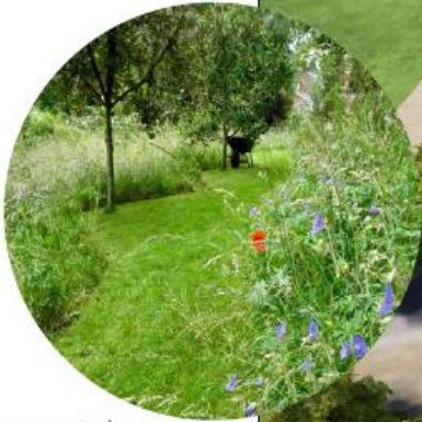
Green spaces to be transformed to mown paths interspersed with wild areas for pollinators and trees.