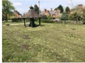
Pump house timberwork, roof and finial repairs

Public footpath link through the village used as a thread to hang small interventions on within the landscape and tie together the various anchors in communal village life.