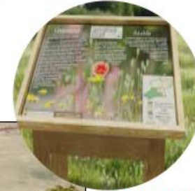
Improved and more numerous Information boards, about the village history, community and rewilding