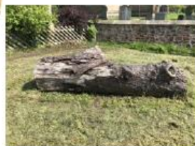
Existing tree trunk shaped into a seating spot