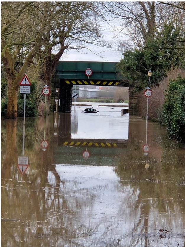
Kingston railway bridge 3 rd January 2024

I'm sure the driver who thought "they could make it" regrets it now.