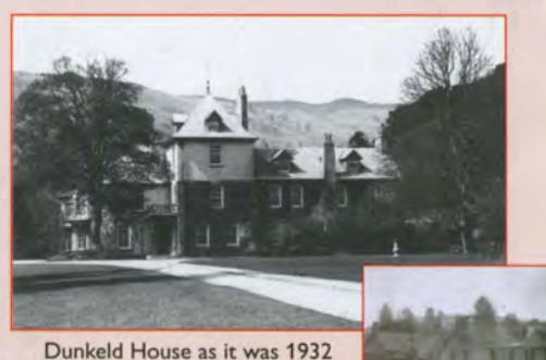
Dunkeld House, under

construction, circa 1900 he first residence of the Earls of Atholl was