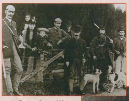
Shooting Party, 1885

Iso transferred from the old house were the existing fireplace in the imposing front hall and the carvings on the balustrades leading to the first floor of the older part of this hotel, as was the stained glass window on the far left of the fireplace showing the Atholl Arms and motto "Furth (forth), and fortune fill the fetters (handcuffs)."