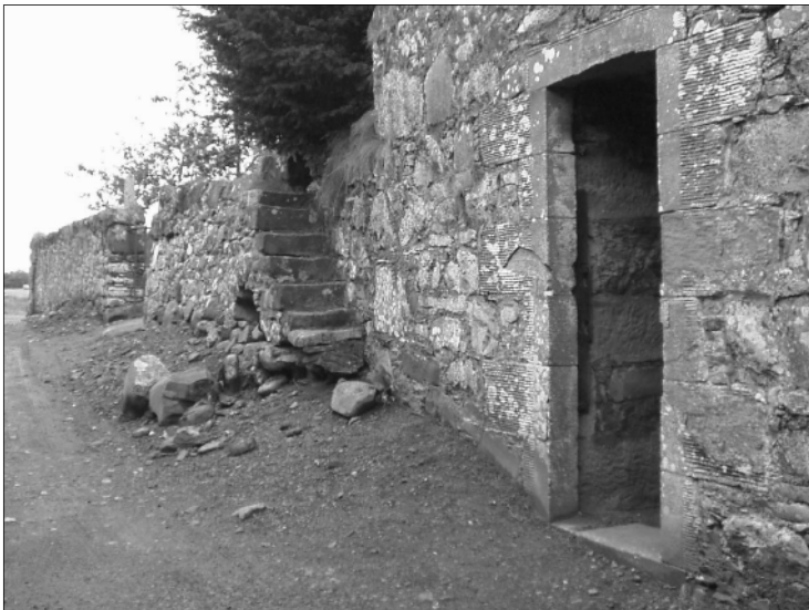
Morthouse door and wall steps