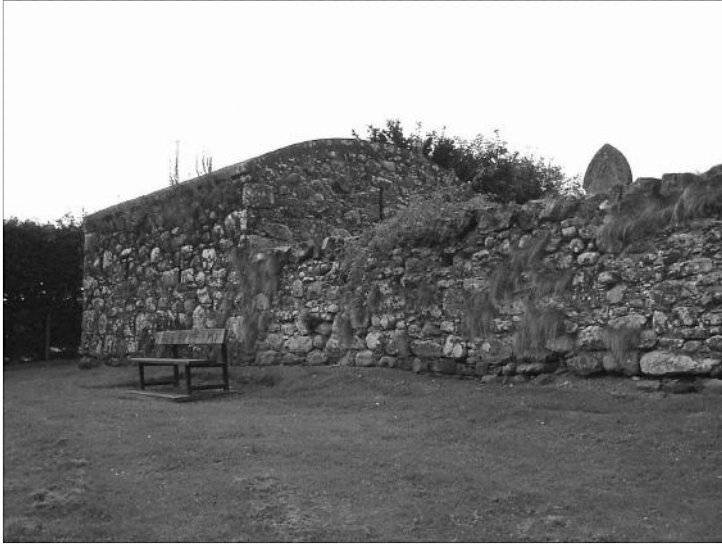
Morthouse and graveyard wall