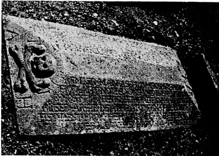
The oldest legible gravestone dated 1680