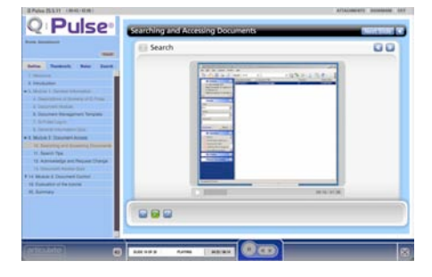
Figure 2: Screenshot of tutorial one slide with interacting items