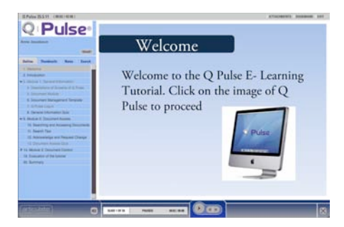
Figure 1: Screenshot of tutorial one opening slide

I developed two Q-Pulse e-learning tutorials based on the information collected from the focus group and design principles of e-learning tutorial. I utilised the multimedia design principles (Mayer, 2008) and Motivation principles (Keller, 2008) to develop the e-learning tutorial. The screenshots of the tutorial are as follows: