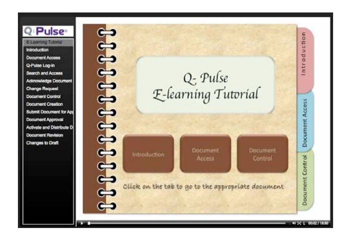
Figure 5: Screenshot of tutorial three opening slide

midwives and nurses. Document control is for managers who will be creating and approving the documents. Clicking on the tab opens the appropriate document. The quiz is included, as shown in Figure 6. The learner can navigate the tutorial using the table of contents.