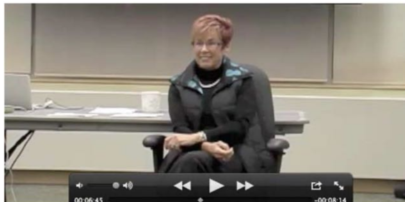
Video 2: Democratic Evaluation Bluewater March 5, 2010 https://www.youtube.com/watch?v=SShZFmETpkk (DeLong, 2011)

In the following video Jackie shows the process she created where the students in her master's classroom give her critical feedback on her teaching of them and how she might improve. (DeLong & Whitehead, 2011).