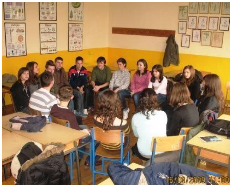
Figure 1. The discussion in the circle

The students assessed this activity at the end of the lesson by completing an evaluation sheet. It consisted of several open-type questions. When asked what they thought of the organisation of the lesson, the students responded that they felt uncertain in the beginning and did not understand what it was about. However, they explained that as the lesson progressed they welcomed the opportunity to use independent thinking skills in discussing the assigned provocation and that they enjoyed a different way of learning. They also expressed their satisfaction with communicating in groups. Many of the students liked this way of learning and they said that they would prefer if other teachers also worked in this way.