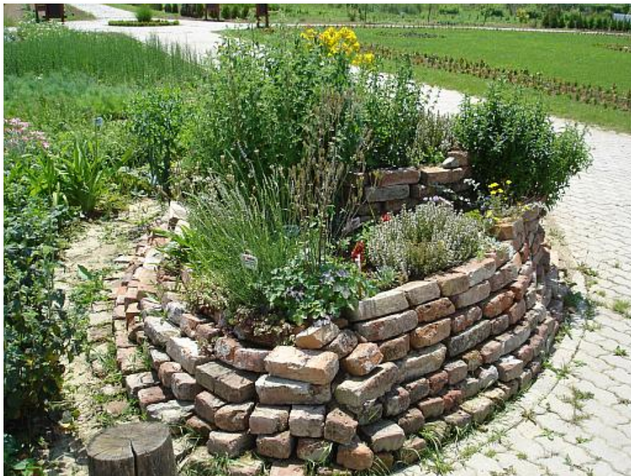
Figure 4. Spiral of medicinal herbs and spices in the garden

With the arrival of spring, we planned to go out in the school garden, our outdoor classroom ( http://www.youtube.com/watch?v=JsTekfuxlak ). The garden is composed of four departments (practical exercises): flowers, forest, vineyard vegetables and gardening. The gardening department is not regulated in the regular way, rather it represents a garden of biological diversity. Also, there are some creative details in the garden, such as a spiral of spices and medicinal plants (Figure 4) that are rarely found in school gardens. The students feel free and have a chance to be creative in this area (see http://www.youtube.com/watch?v=BmWK5pwVdBw ).