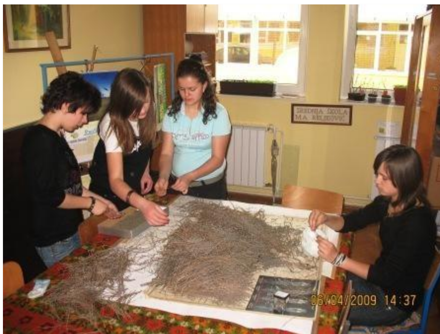
Figure 5. Students are preparing the spice

As they had freedom of choice, some students chose to remain in the classroom and learn the plant production content from textbooks.