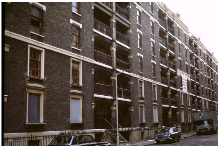
Figure 1: Gladstone Buildings where my father lived 1914–1940 (early 1970s prior to demolition)

Against this background, I shall now look backwards in time for the sources of my values, which may help to give them further expression within the context of this paper as a values-based account of my educational influence. Those sources begin, within my own memory of direct experience, with my four grandparents, who raised their children (my parents) barely 100 yards apart during the early years of the 20th century, in the tenement flats located in Shoreditch in the East End of London UK (Figure 1). My father's family of six lived in three rooms in Gladstone Buildings and my mother's family of four lived in two rooms in Albert Buildings. It is worth noting that my mother and her sister were born 14 months apart – thereafter, their father owned a washable condom that lived on the side of the draining board next to the sink (as my mother reported, when in her 70s).