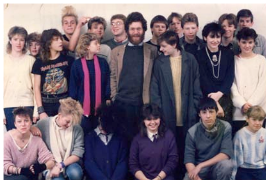
Figure 3: Working in a state comprehensive school, 1986

Before starting work at the University of Bath in 2000, I had completed a B.Sc. in Chemistry (Nottingham University, 1968) and a Diploma in Education (Bath University, 1971). The approach to Science-teaching at that time was the 'Nuffield Scheme', based on the concept of 'guided discovery', through which children's studies were carried out through hands-on experiments as they worked as active enquirers. I understood my role to involve setting the topic for investigation – largely in the form of questions – and then introducing suitable experimental approaches. This approach closely mirrored the action-reflection cycle that I encountered later when studying Action Research at Master's level. My certification as a teacher was followed by 18 years as a secondary school Chemistry teacher. Figure 3 shows me in the company of members of my tutor-group who were about to leave school or enter the sixth form.