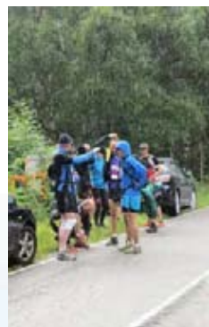
25 Race start at Dundonnel