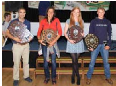
Race Winners 2014