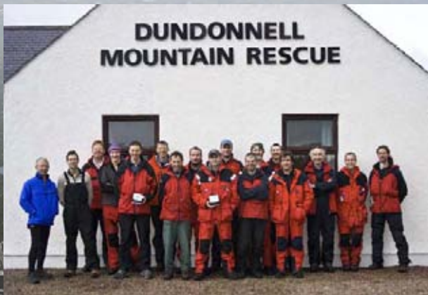
2005 - Dundonnell Mountain Rescue