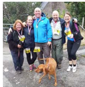
Tarry Ile team at GWC 2014

The area is stunning, the folk are welcoming, the fundraising is fantastic, the bog is ... boggyfull .... roll on 15th August!