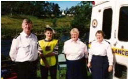
1996 - St Andrews First Aid