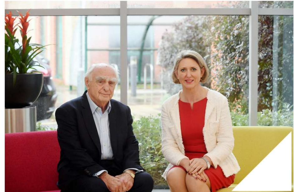
Deeley Group Community Developer Partnership Approach