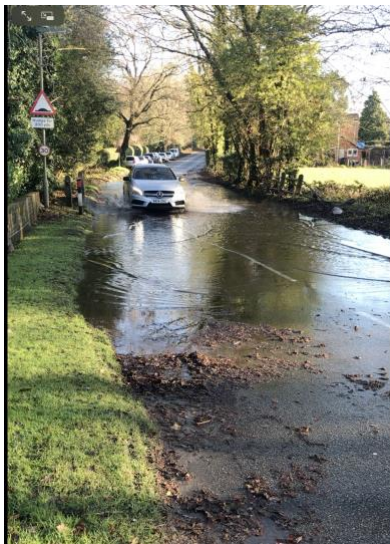
Current flooding south of the Gole Road site across School Lane at Causeway Bridge when flash floods occur