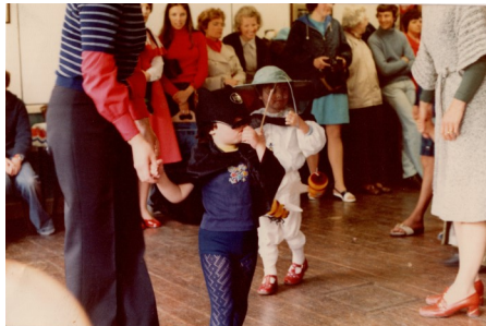
The children's fancy dress competition- do you recognise anyone? Pirbright Historians would love to put names to faces!