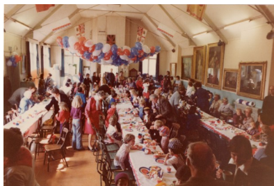
The village hall decorated for the children's party, and the party in full swing!