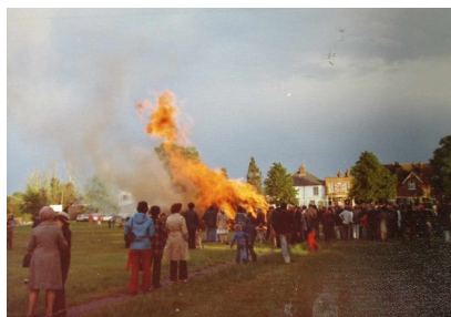
A note on the back of this photograph claims it was 'The Biggest Bonfire ever lit in Pirbright'.