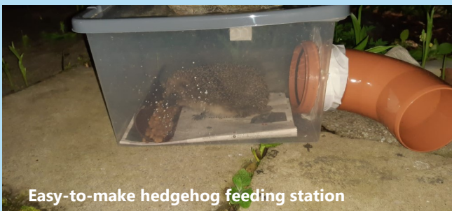
Easy-to-make hedgehog feeding station