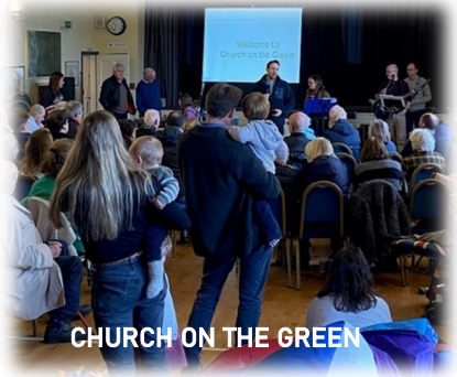
CHURCH ON THE GREEN

Bouncy castle and palm waving - this one is not to be missed! At the special time of 3pm in Lord Pirbright's Hall