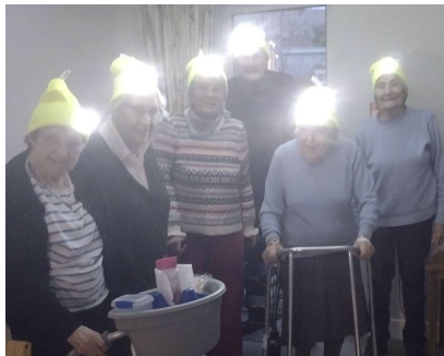
(And no, this is not the famous PeriNews April Fool story!)

Residents often reflect on the days when common sense was deemed more important than regulations. Sometimes regulations can prevent one danger, but create a different one. For example, clearly we must have fire doors, but they are heavy so an older person risks falling trying to open a heavy door. If we have a fire alarm, residents have to evacuate even in the dark, but holding a torch and steering a wheelie isn't easy. Our 102-year-old resident came up with the perfect solution: beanie hats with lights on! Looks a bit daft, but they're warm and residents can see where they're going with hands free for wheelies. Hopefully we never have to use them, but it was good fun to capture a photo opportunity for PeriNews!