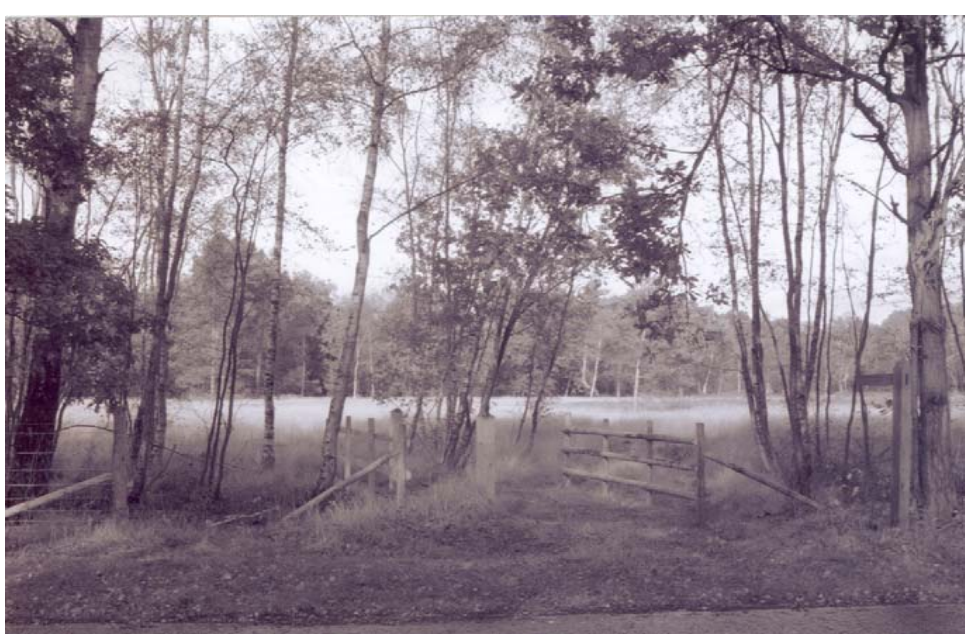
Pirbright Common from Cemetery Pales (Walk 5)