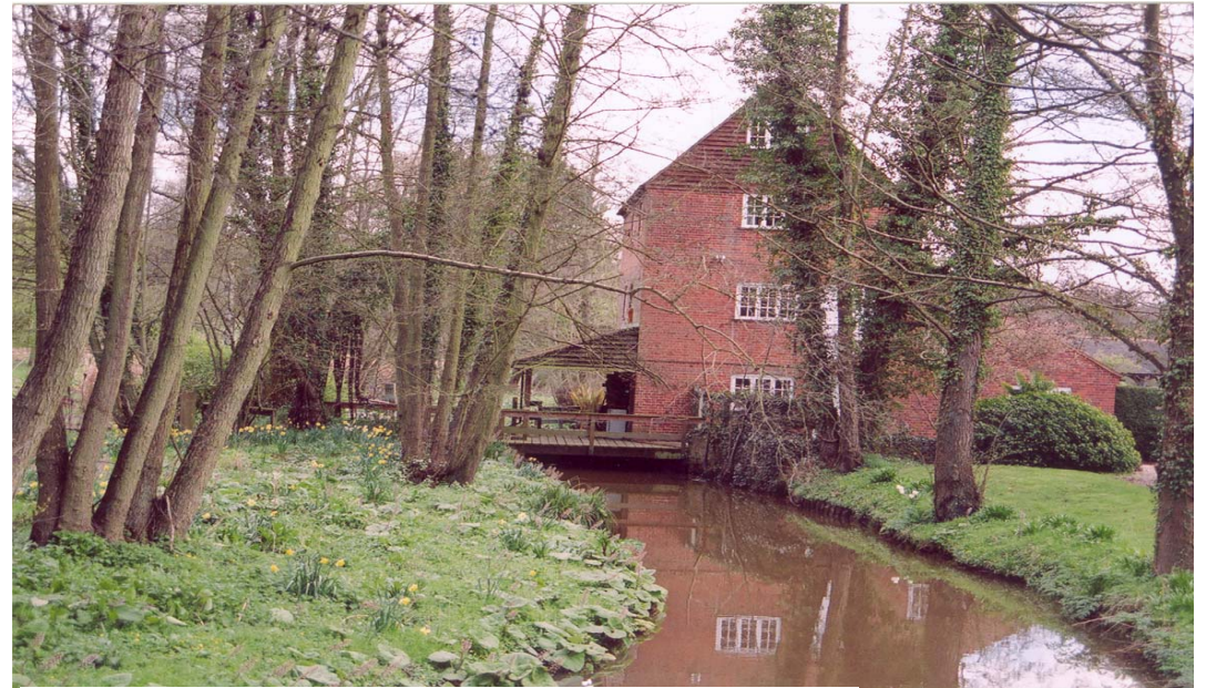
Rickford Mill House (Walk 7)