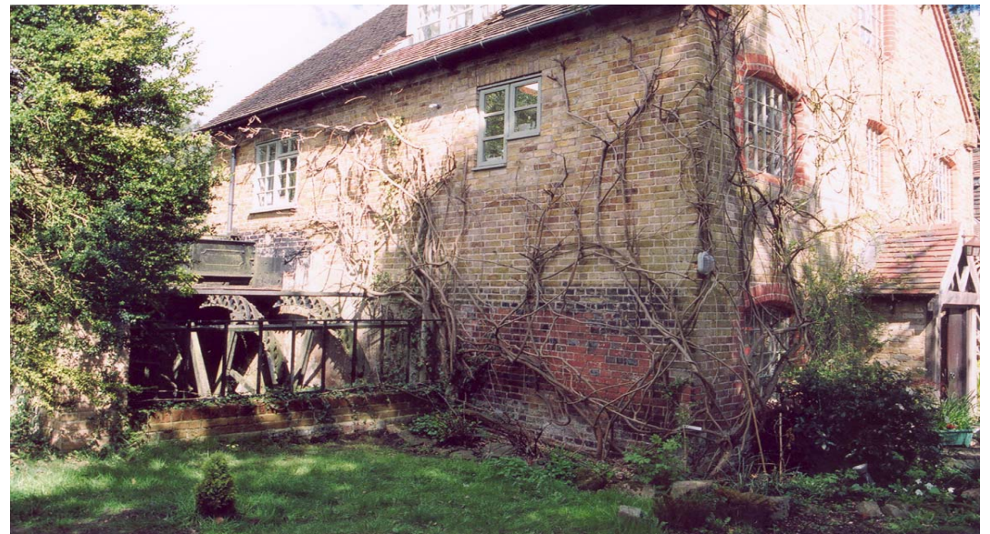
Heath Mill (Walks 5 & 7)