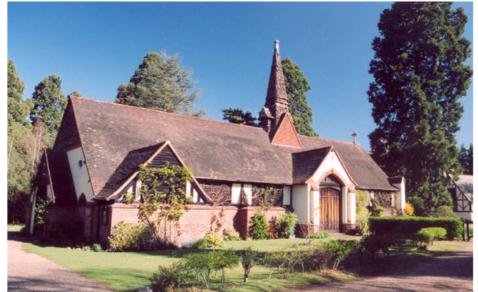
St Edwards Orthodox Chapel, Brookwood Cemetery (Walk 4)