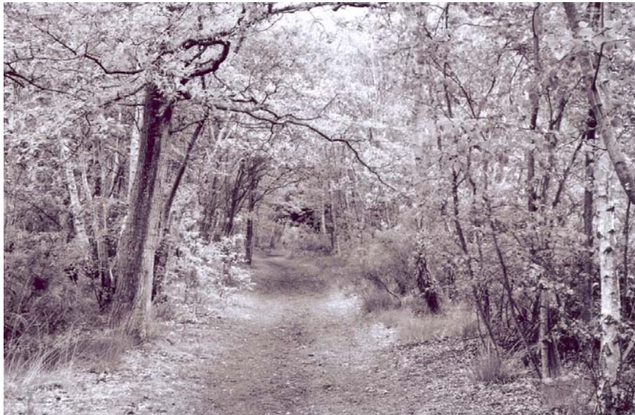
Pirbright Common to Chapel Lane (Walk 4)