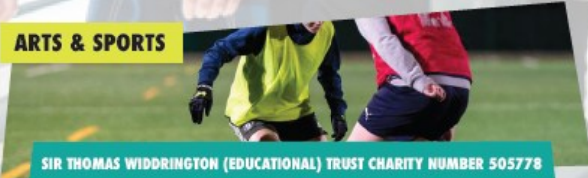
ARTS & SPORTS

SIR THOMAS WIDDRINGTON (EDUCATIONAL) TRUST CHARITY NUMBER 505778