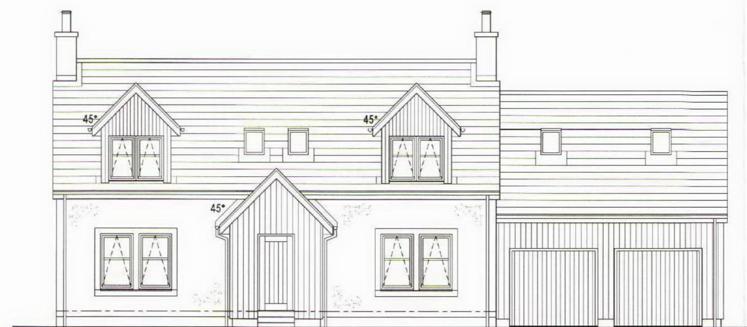
Front Elevation 1:100