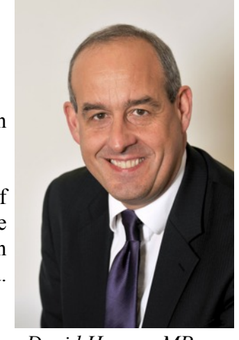
David Hanson MP.

I wrote to give my view which focused particularly on the traffic implications of any agreed approval. Traffic concerns on the main road through the village have been a real issue for local people and it seems a difficult decision to add to it through this proposal. It can only mean more heavy lorries on, what is an already busy road. I know concerns still exist and I'm happy to hear of any issues.