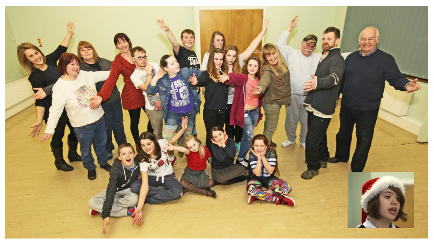
PERFORMERS: The cast of Gwernymynydd Pantomime Group's Jack and the Beanstalk show.