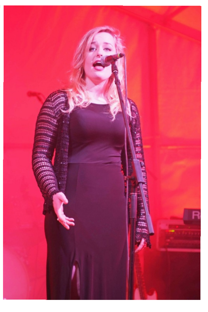
One of the performers at this year's Nercwys Music Festival.

Total money raised during the three years the event has taken place is a massive £19,747, all of which has been donated to good causes.