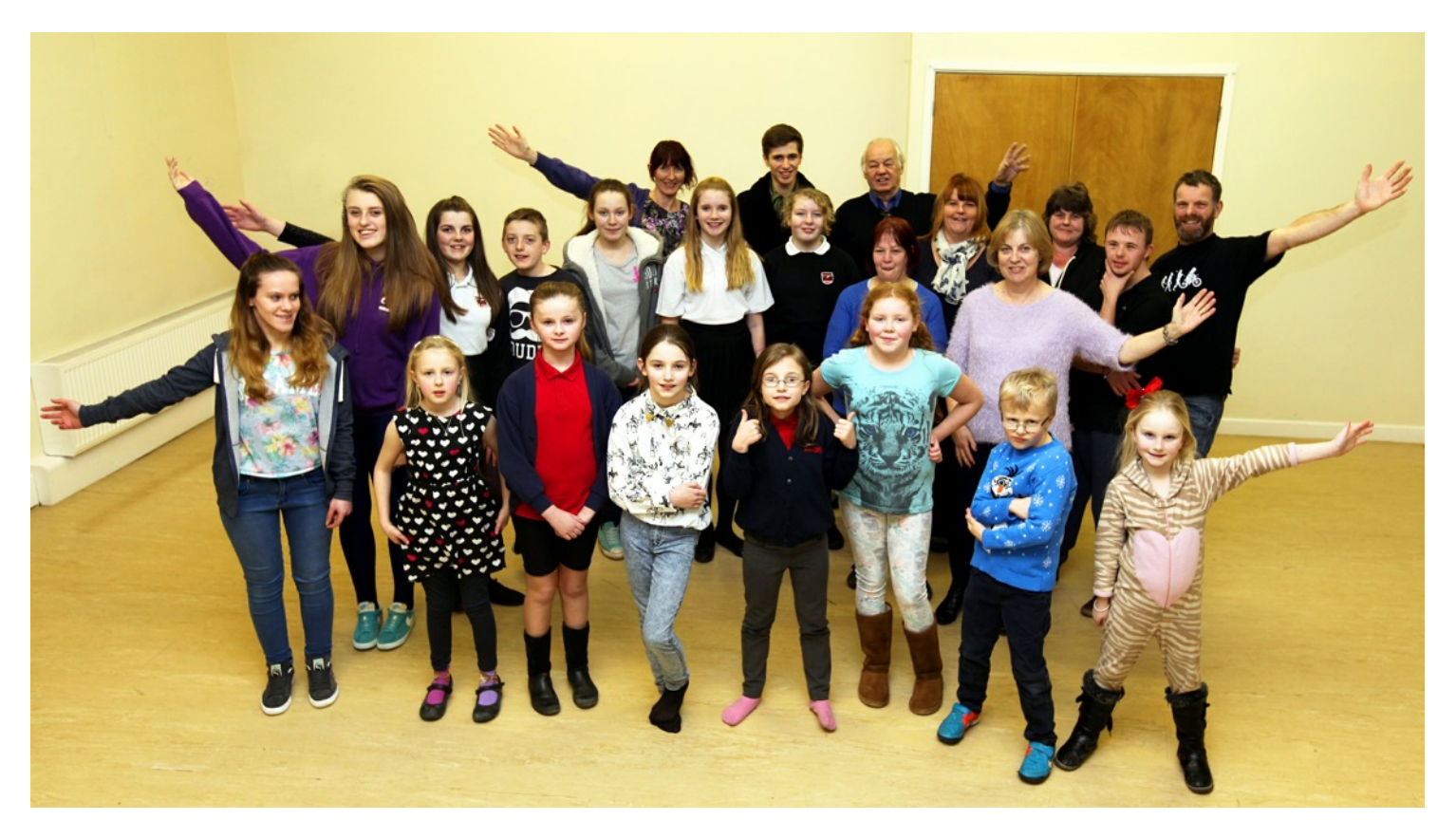
CAST: The Pantomime Group are looking forward to performing The Legend of Loggerheads.