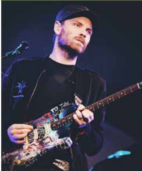
Jonny Buckland of Coldplay