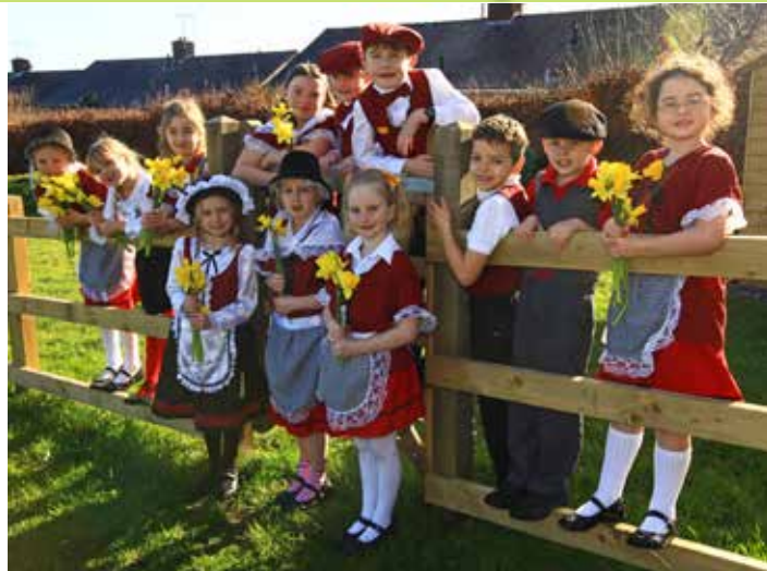
SPECIAL DAY: Gwernymynydd Primary School children dressed in traditional Welsh costumes to celebrate St David's Day

She added: "Our pupils have worked hard perfecting their traditional folk dancing and making sure their songs, which they sang beautifully in Welsh, were word perfect."