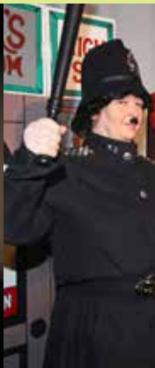
'ELLO 'ELLO: arm of the la Teese, who p