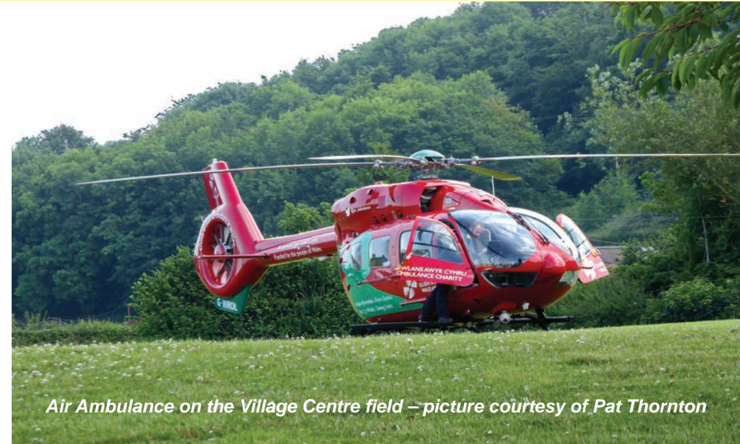
Air Ambulance on the Village Centre field

A Wales Air Ambulance used the village centre field as a landing site after a Ruthin Road collision left a cyclist with serious injuries.