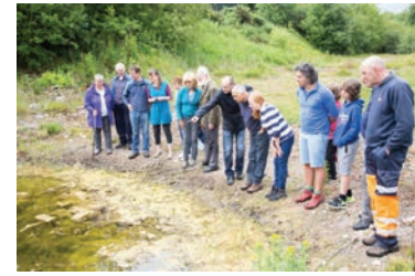
Villagers check out the newt ponds.