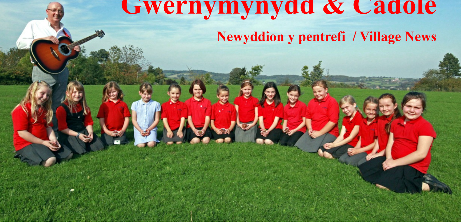
Gwernymynydd School Vocal Group