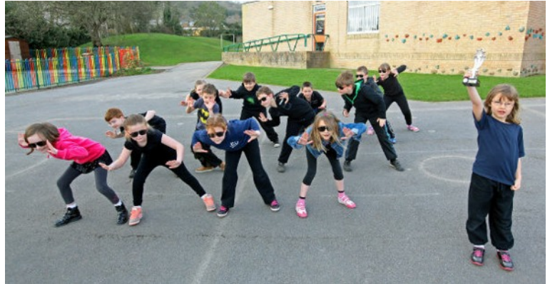
SLICK MOVES: The Gwernymynydd Primary School Year 3 and 4 street dance team which won the Flintshire Festival of Youth Sport 2013 street dance competition.

This year's event saw more than 2,000 children take part at 10 different events, from cheer-leading to speedball and touch rugby league to street dance at venues across Flintshire.