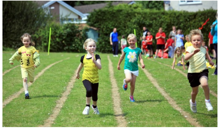
GO FOR IT: Girls enjoy one of their races.