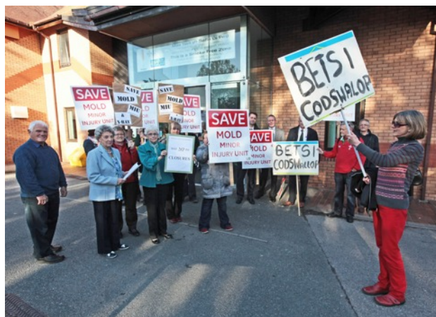
PROTEST: Demonstrators outside Mold Cottage Hospital last September as the fight began to save the unit