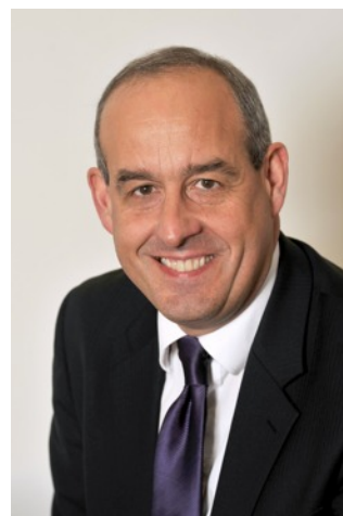
David Hanson MP.

Sadly, I missed the event but I hope it encouraged young villagers to take up riding. Cycling is an important part of keeping our nation healthy and reducing UK carbon emissions and I believe the wide-ranging social, health and economic benefits increased participation in cycling would bring are worth pursuing. I have recently taken part in debates in Westminster calling on the Government to continue examining what can be done to help build on the legacy of London 2012 and to get people onto bikes and safe on our roads.