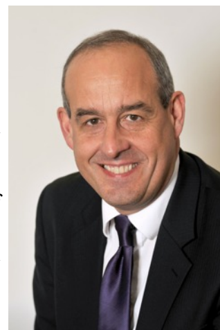
David Hanson MP.

I wrote to give my view which focused particularly on the traffic implications of any agreed approval. Traffic concerns on the main road through the village have been a real issue for local people and it seems a difficult decision to add to it through this proposal. It can only mean more heavy lorries on, what is an already busy road. I know concerns still exist and I'm happy to hear of any issues.