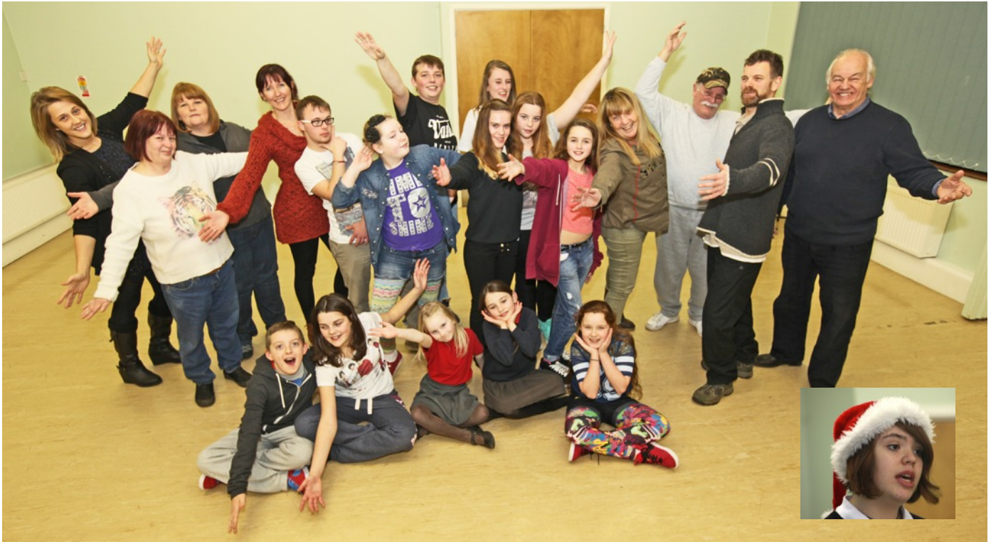
PERFORMERS: The cast of Gwernymynydd Pantomime Group's Jack and the Beanstalk show.