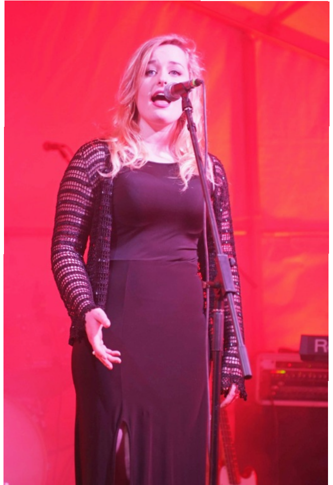
One of the performers at this year’s Nercwys Music Festival.

Total money raised during the three years the event has taken place is a massive £19,747, all of which has been donated to good causes.