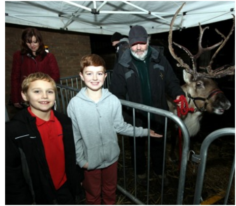
Rudolph, seen here at the 2012 school Christmas Fayre, is coming back again this year.