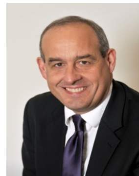
David Hanson MP.

I have been in contact with the owners to try and ensure some progress is made so the site does not remain an eye-sore. I will report back when get a response. Gwernymynydd deserves better and should not have a derelict building blighting the local area.