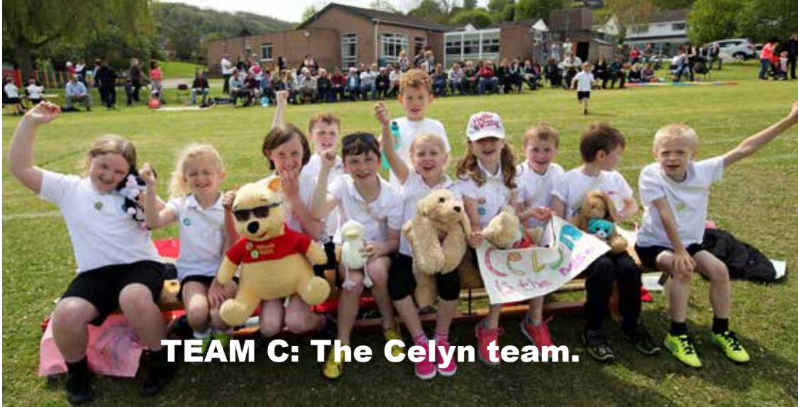
TEAM C: The Celyn team.