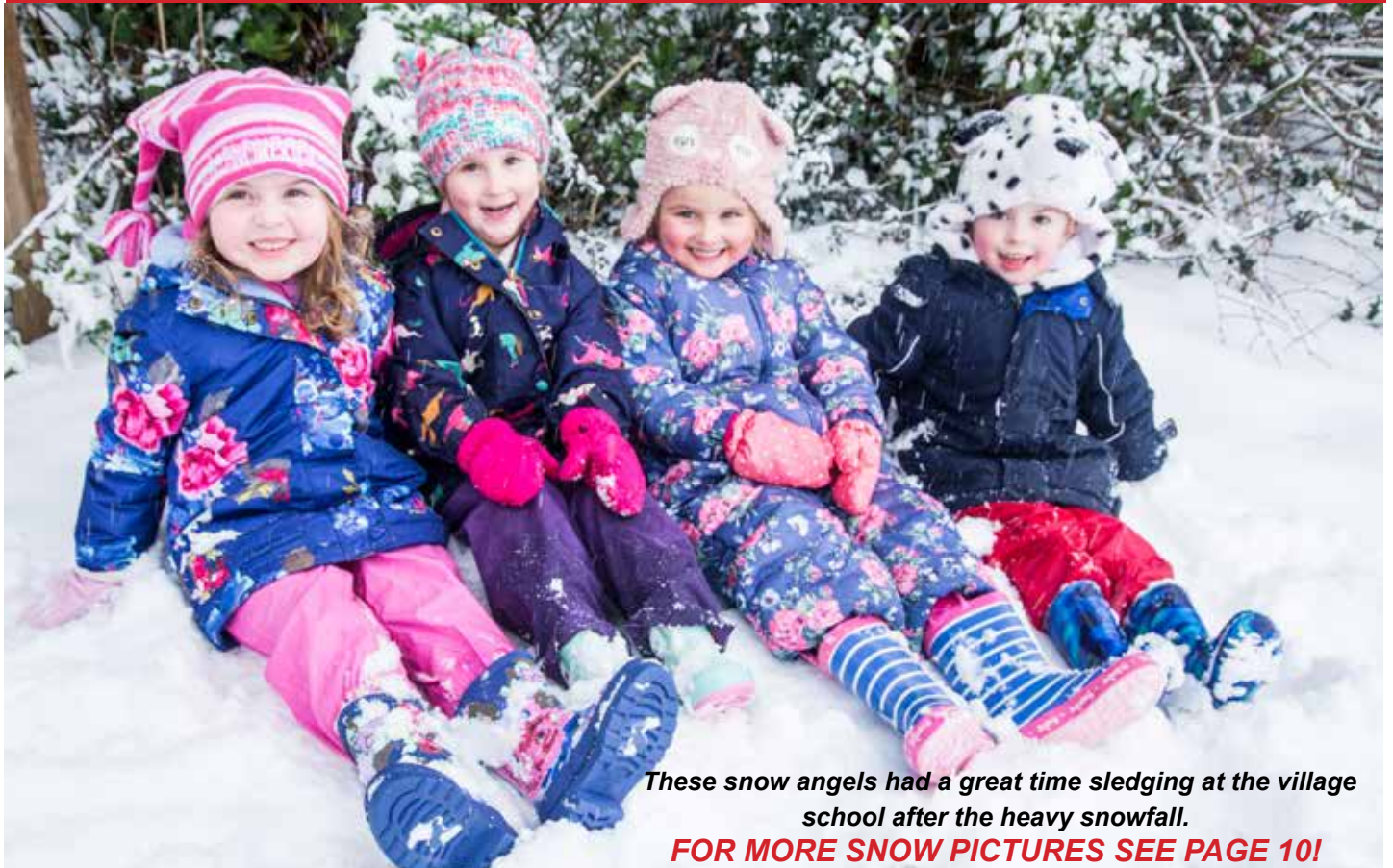
These snow angels had a great time sledging at the village school after the heavy snowfall.