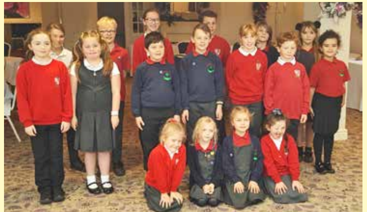
School council members at the Plas Hafod Hotel.

"We have now launched a competition inviting all pupils to design a logo for the federation over the Christmas holiday with the winner being announced in January."