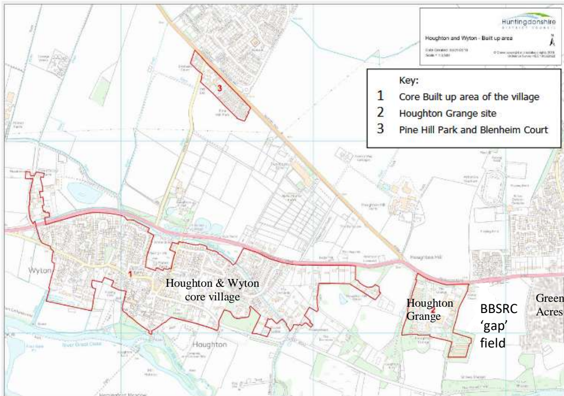
Fig 1: Extract from The Houghton & Wyton Neighbourhood Plan 2018 adapted to show the gap field.